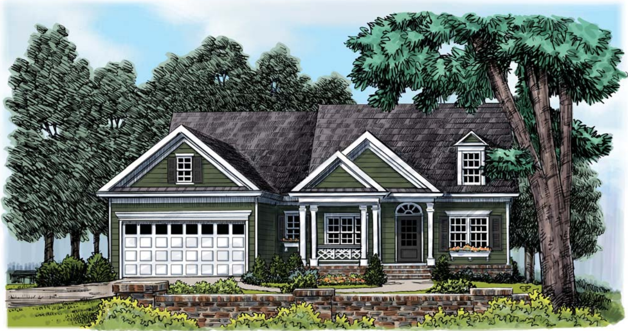
Above elevation is for illustration purposes only. Actual colors, materials, landscaping, and other details can change at any time. Ask for details.