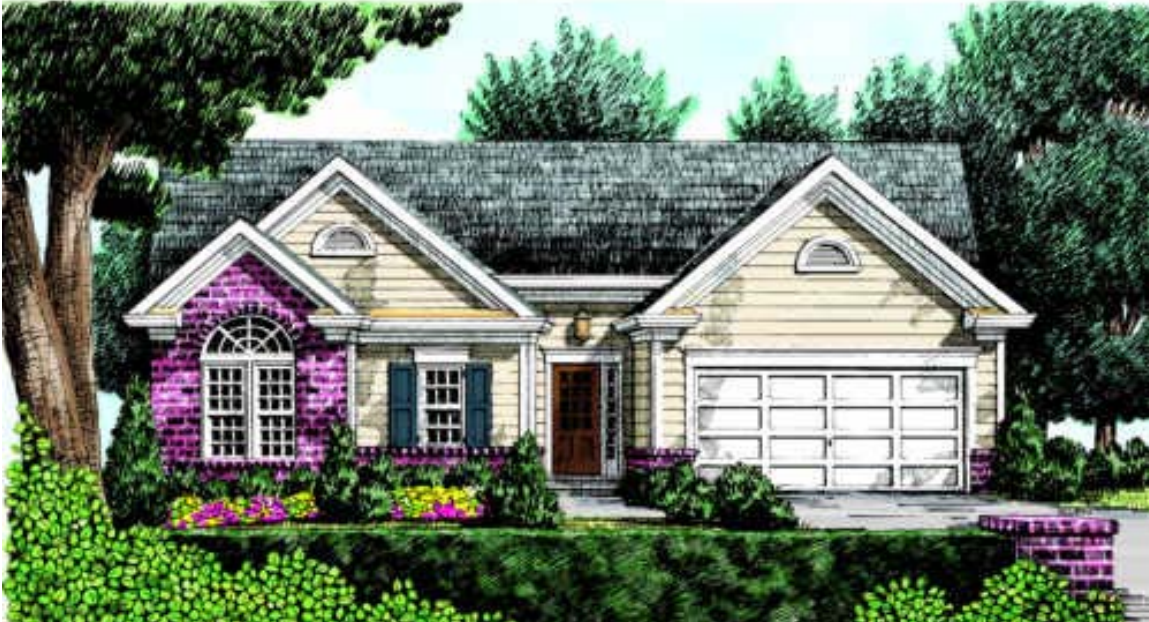
Above elevation is for illustration purposes only. Actual colors, materials, landscaping and other details can change at any time.