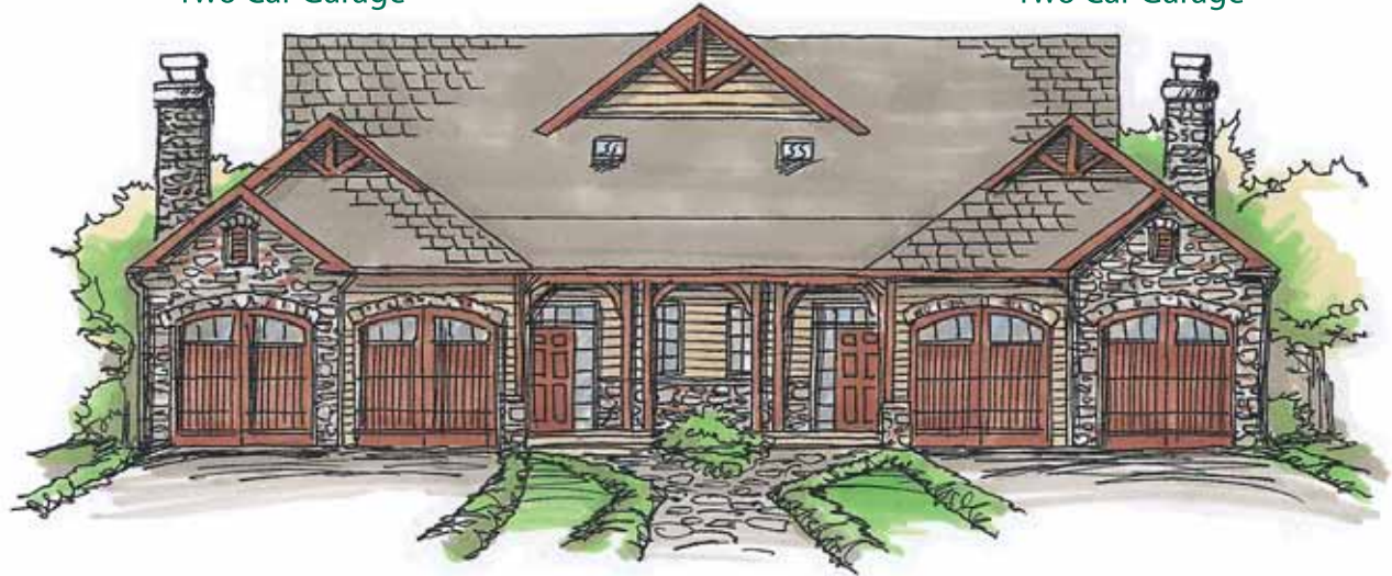
Town Home Front Elevation

Unit B 3 Bedrooms - 3 1/2 Baths Two Car Garage