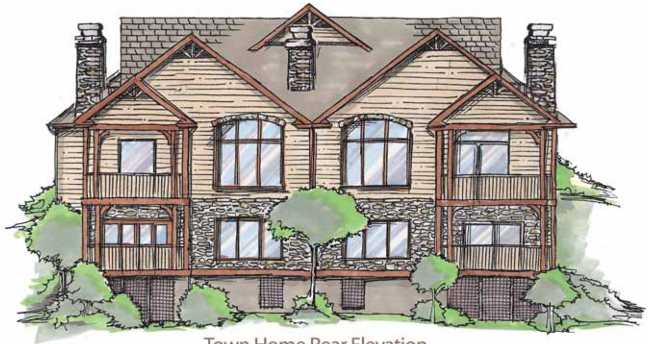
Town Home Rear Elevation

THESE DESIGNS ARE ARTISTIC REPRESENTATIONS. DIMENSIONS AND DETAILS ARE SUBJECT TO CHANGE. 1/10/06